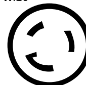
Nema L6-30 Twist